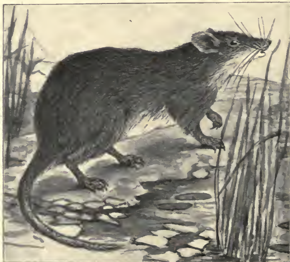
FIG. XXXVII. HETEROMYS ALLENI. ALLEN'S SPINY MOUSE.